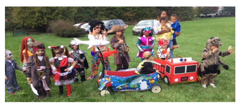
Halloween costume winners